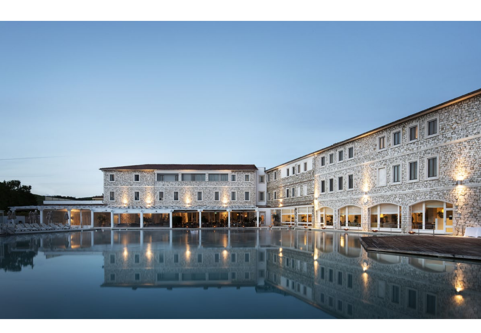
The 5* Resort is nestled among beautiful, unspoiled countryside in the heart of Tuscan Maremma. It features a SPA&Beauty Clinic, Hot Spring Pools and a Geo-certified 18-hle Golf Course. Here a millenary Natural Hot Spring has been flowing for 3,000 years.